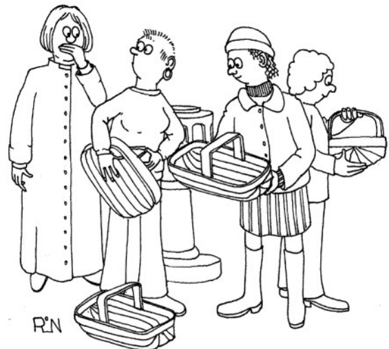
Shirley caught the flower ladies red-handed, dealing trugs