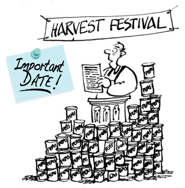
...I take it our local supermarket has a rather good offer on tinned peas at the moment!

Remember, remember the 6th of October! Harvest Festival at church from 10.30am.